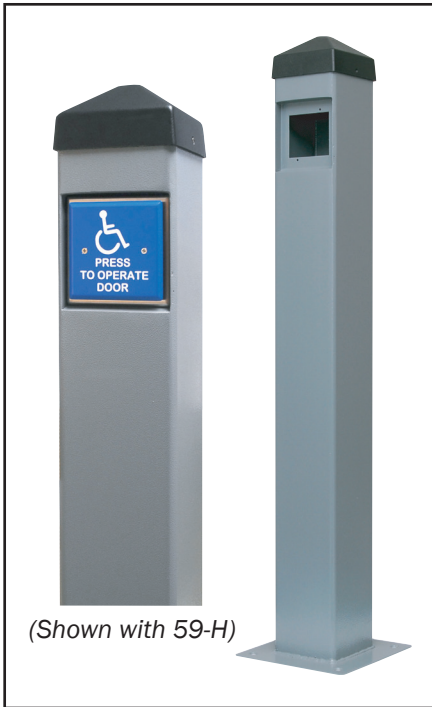
(Shown with 59-H)

base coat on all surfaces and an industrial grade exterior powder coat finish. An innovative ABS plastic rust shield fits under the mounting shoe to help block the corrosive action of concrete to steel contact. The integral plastic cap allows superior wireless signal range.