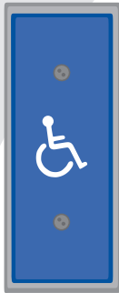
#59J-W (Blue Powder Coat with White Paint Filled Legend)