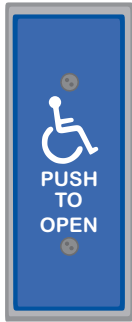
#59J-H (Blue Powder Coat with White Paint Filled Legend)