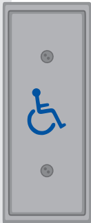
#59J-WSS (Stainless Steel with Blue Paint Filled Legend)