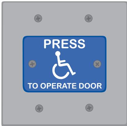
#1078-H (Anodized Blue Aluminum Face Plate with Engraved Legend)