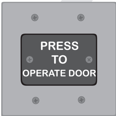
#1078-P (Anodized Black Aluminum Face Plate with Engraved Legend)

provide reliable activation of any automatic door.